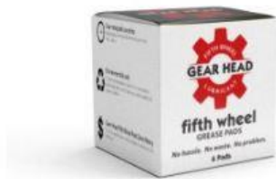
Purchase 11 to 99 Case Quantities – Gear Head 5th Wheel Pads