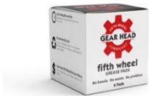
Purchase 1 to 10 Case Quantities – Gear Head 5th Wheel Pads