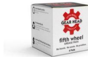
Purchase 100+ Case Quantities – Gear Head 5th Wheel Pads